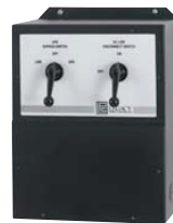
Maintenance Bypass Switch