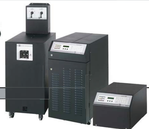
Heritage Family of Products