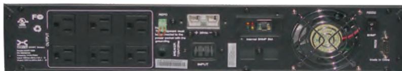
NXRT-1000 UPS Rear View

Xtreme value, Xtreme performance, Xtreme reliability