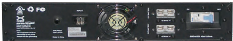
Extended Battery Pack 1 Rear View